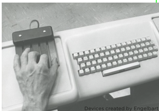
Devices created by Engelbart

- Augmenting human intellect Douglas Engelbart