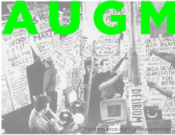
Performance during "Happenings"