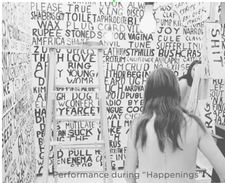
Performance during "Happenings"

- Augmenting human intellect Douglas Engelbart