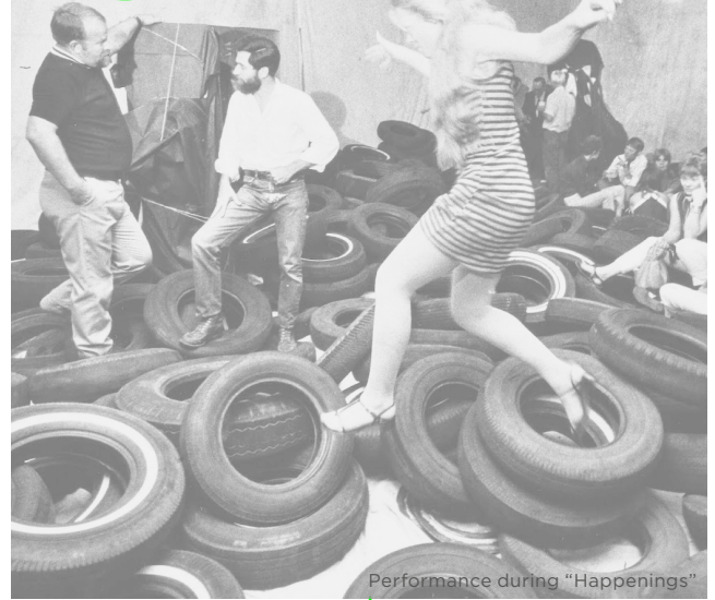
Performance during "Happenings"