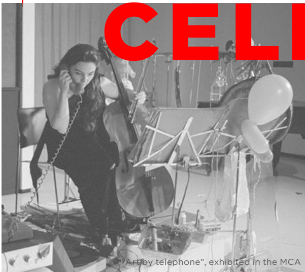
"Art by telephone", exhibited in the MCA

"Thus, with automation, for example, the new patterns of human association tend to eliminate jobs, it is true. That is the negative result. Positively, automation creates roles for people, which is to say depth of involvement in their work and human association that our preceding mechanical technology had destroyed."