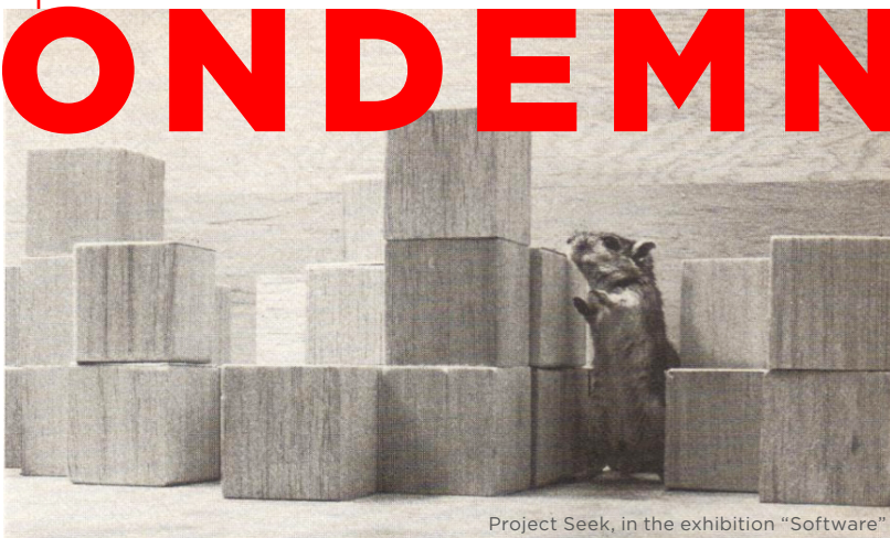
Project Seek, in the exhibition "Software"

"It is not an exaggeration to say that the future of modern society and the stability of its inner life depend in large part on the maintenance of an equilibrium between the strength of the techniques of communication and the capacity of the individual's own reaction."